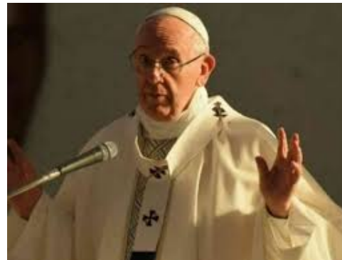
Pope Francis, head of the Catholic Church