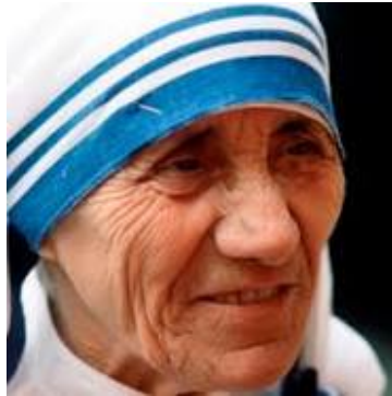
Mother Teresa of Kolkata, awarded the Nobel Peace Prize in 1979