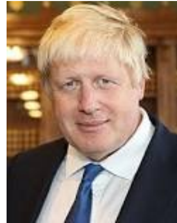
Boris Johnson, British Prime Minister and leader of the Conservative Party