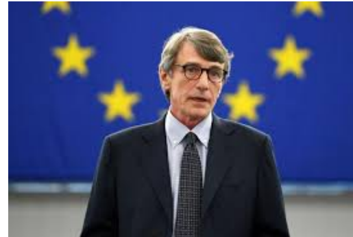
David Maria Sassoli, President of the EU Parliament