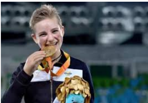
Bebe Vio, Italian wheelchair fencer, World and Paralympic champion