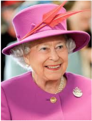
Elizabeth II, Queen of the United Kingdom