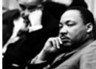
Martin Luther King Jr., Leader of the Civil Rights Movement