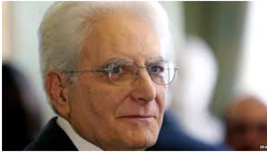
Sergio Mattarella, the Italian President