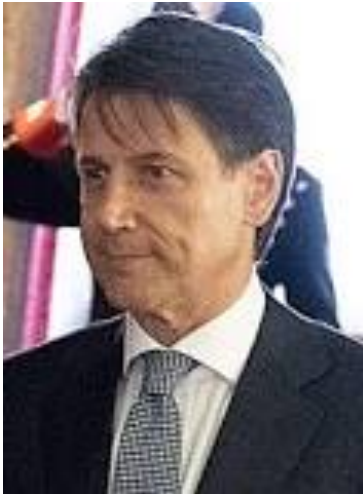
Giuseppe Conte, President of the Council of Ministers of the Italian Republic