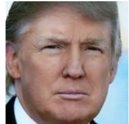
Donald Trump, current president of the USA