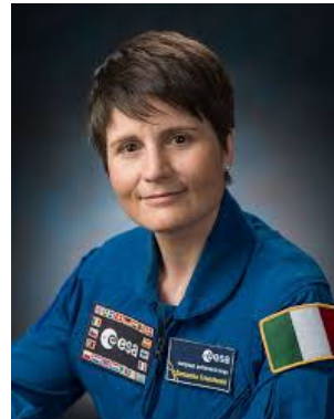
Samantha Cristoforetti, the first Italian woman to get into space