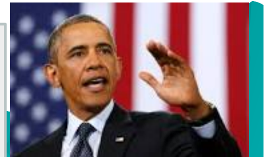
Barack Hussein Obama II, Former president of the USA