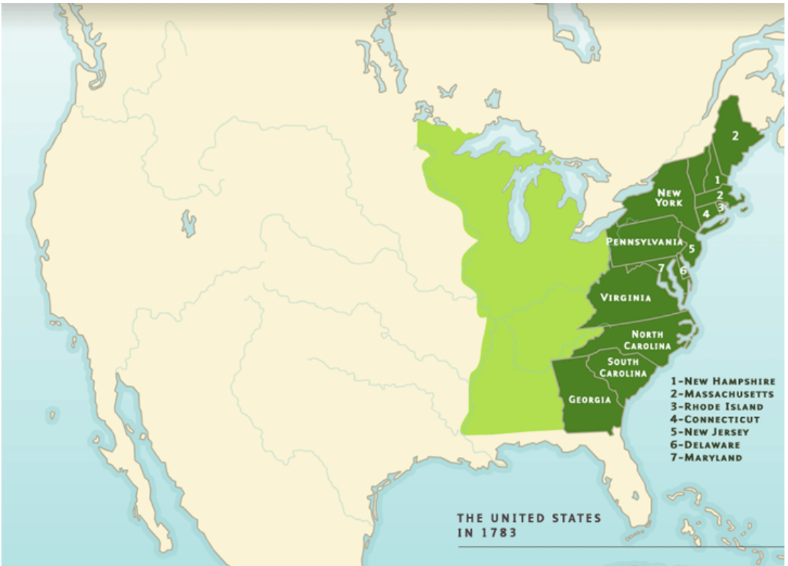
The birth of the nation