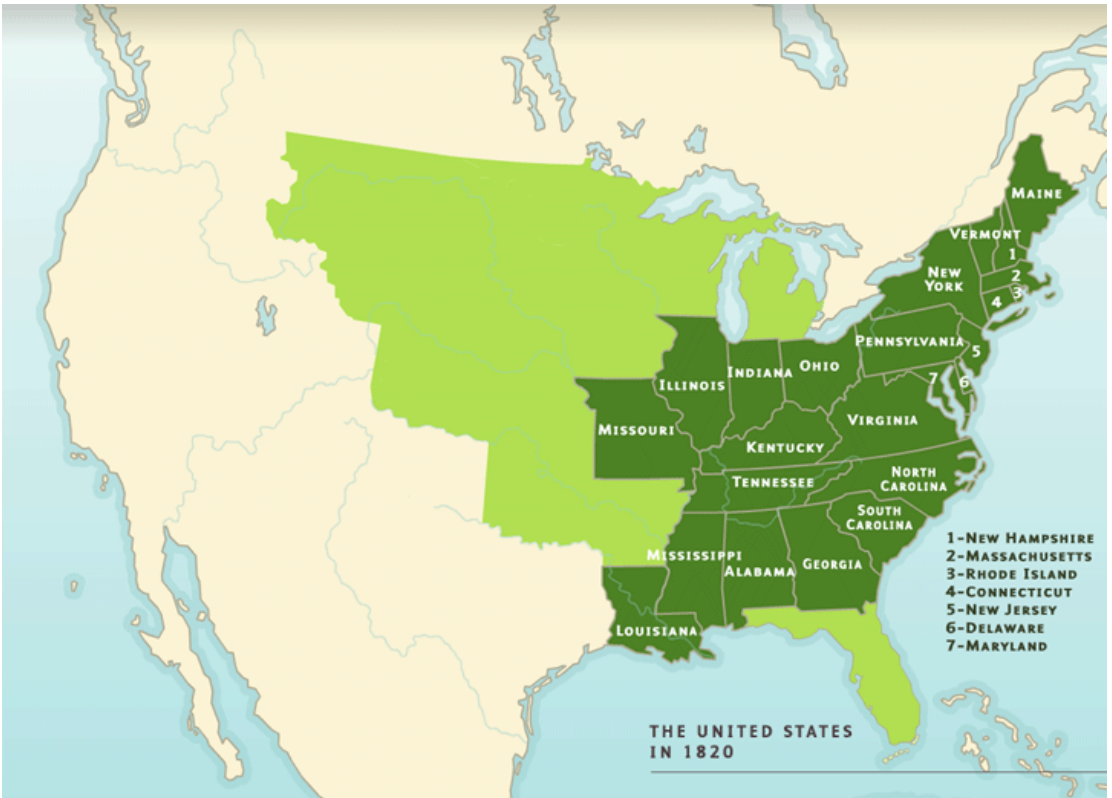
The US in 1820