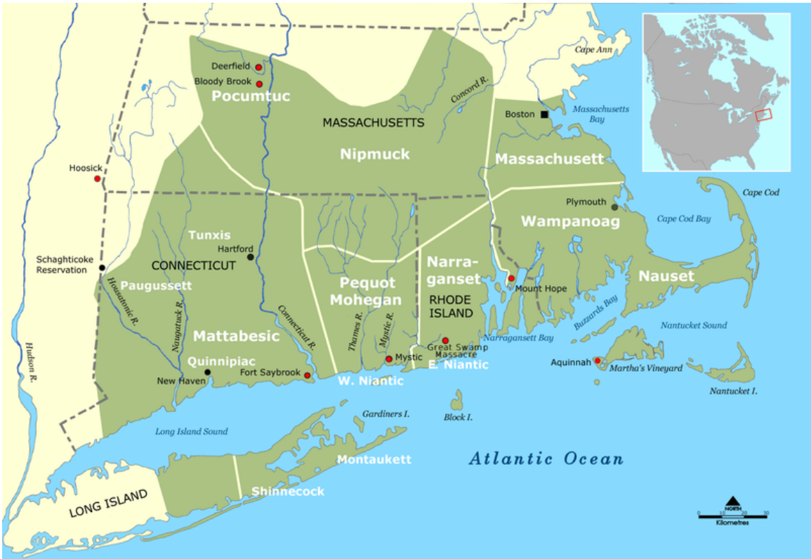
Puritans' settlements in the New World